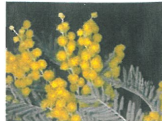
Acacia mearnsii (Black Wattle) Up to 15 metre tall, 5-8 metres wide, dark trunk Flowers Oct Sep to Dec/ Screen plant Acacias live for 15 to 20 years but are fast growing